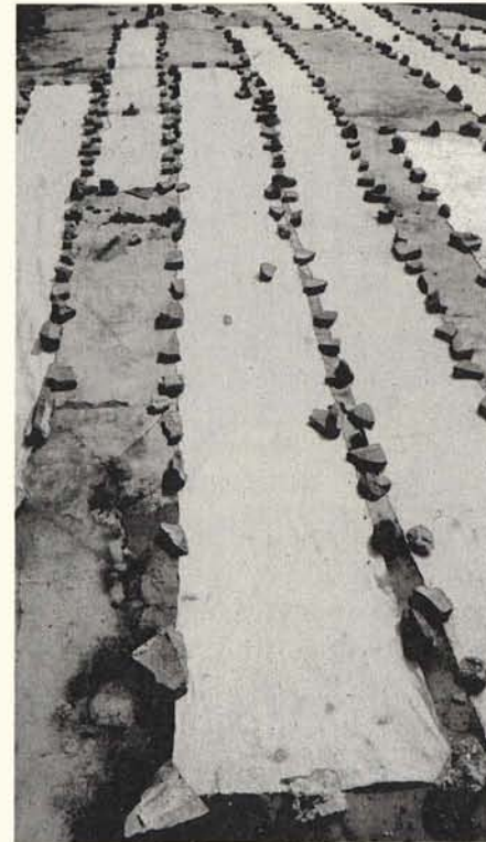
Fig. 3. (a) Drying barkcloth on an old concrete slab, Taunovo village, Vatulele Island, Fiji, 1985. All of these pieces have two or more modules end-joined together, except one in the top right which is a “half-length” made by felting two halves of one bark together.

As can be seen from the above description, an enormous amount of care has to be taken in this process to carefully maintain the fiber structure of the bark during beating and felting. A good craftswoman can produce a remarkably smooth and even sheet that is a light creamy-white in color. However, as testing reveals, the inherent bark structure means that while the resulting sheets have exceptional crosswise tear-strength, they are relatively weak in terms of lengthwise tearing, and burst strength is similarly not great. Finally, if sheets get wet after completion, the layers, whether felted or glued, tend to delaminate fairly readily.