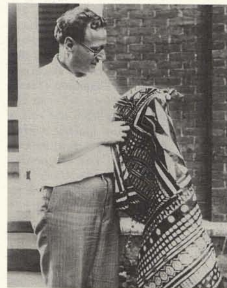
Fig. 1. Dard Hunter admiring a piece of Fijian masi barkcloth from his collection. 6 The characteristic bold geometric figuration on this sample is from Thakaundrove Province in Northeast Fiji (probably the island of Taveuni). The piece he is holding may be RCWAMP item #89.2139. 78 x 65 inches (1.98 x 1.65 m). 7

mation, implements and specimens relating to the making and decorating of bark-paper (1927). As mentioned above, he also gave a brief account in his book Papermaking (1943) (fig. 1).